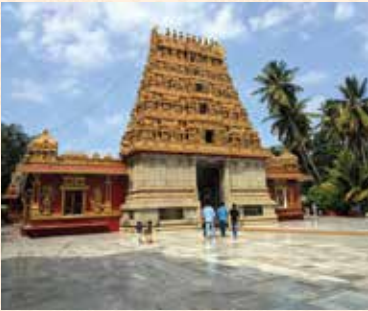
Kudroli Sri Gokarnanatheshwara Temple - 400 m