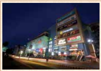
City Centre (2010) K S Rao Road Land Owner & Co-promoter