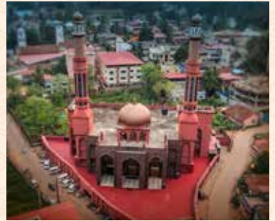
Jamia Masjid - 200 m