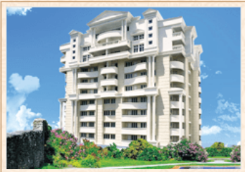
Acropolis (2005) Light House Hill