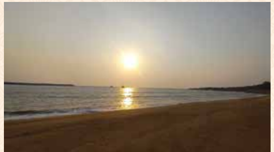
Confluence of the rivers Netravati & Gurupur and Arabian Sea

Let AVENTUS be the harbinger of blissful times ahead for you and your family.