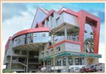
Maximus (2006) Light House Hill