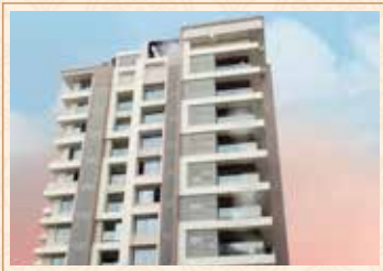
Aureus (2018) Vas Lane, Falnir PRM/KA/RERA/1257/334/PR/171021/000490