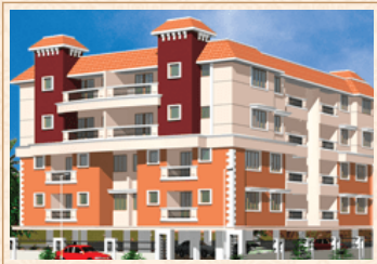
Adelphia (2009) Attavar