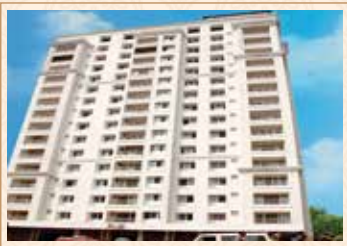
Aristaa Enclave (2014) Pandeshwar