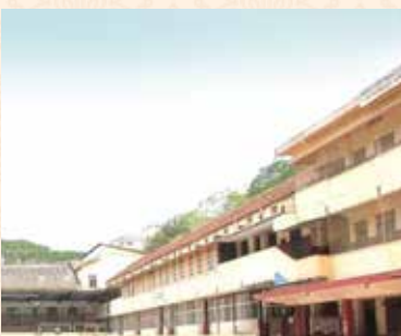
Canara School - 1.3 km