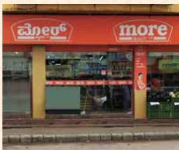
More Supermarket - 300 m