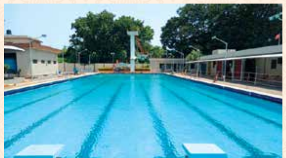
Public Swimming Pool - 1.3 km