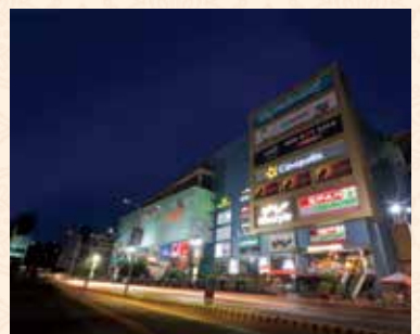
City Centre Mall - 2.5 km