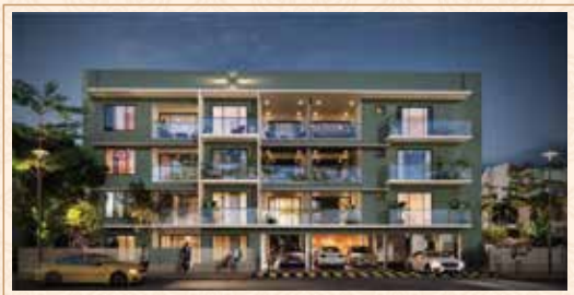
Classique Woodsville Yelahanka, Bengaluru RERA R. No.: PRM/KA/RERA/1251/472/PR/210319/004040