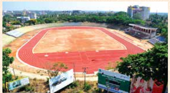
Mangala Stadium - 1.3 km