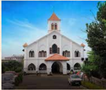
CSI Shanthi Cathedral Church - 400 m